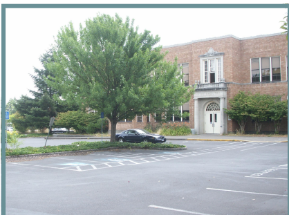
Parking and Marked Crosswalks

This striped pavement marking at the pedestrian route at Portsmouth is a good example which illustrates a marked accessible route from parking to the curb cut in front of the building entry.